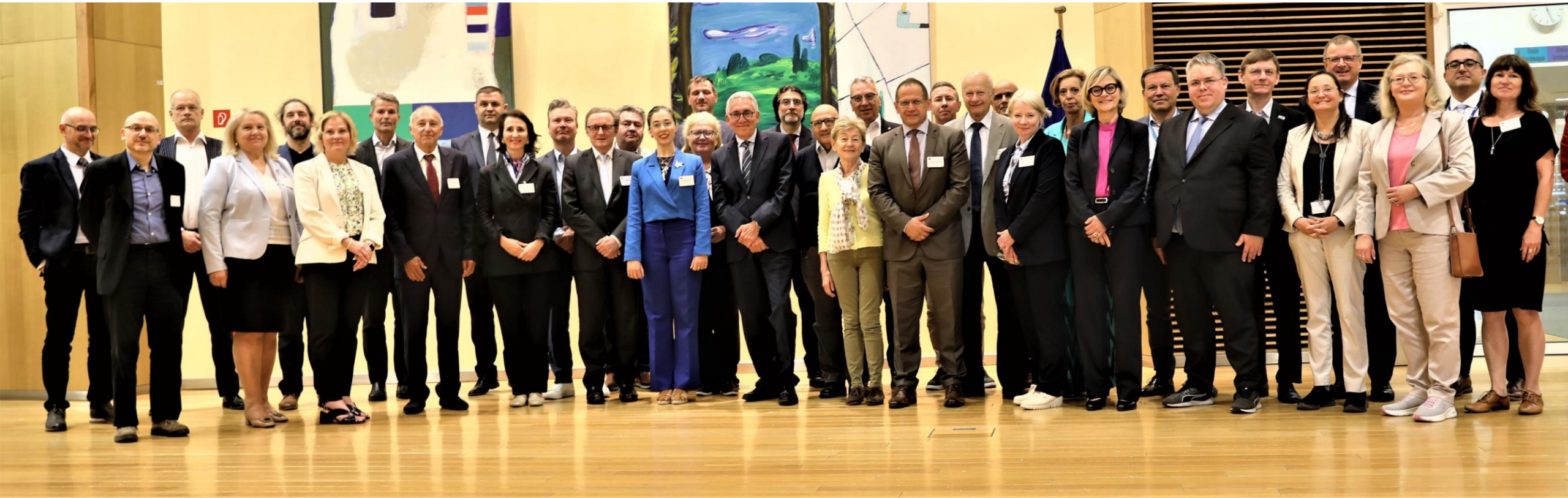
Members of the JRC Board of Governors at their 133rd meeting. June 2024. Brussels, Belgium.